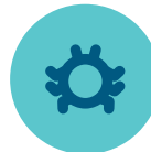
Dust & Storage Mites

Allergens can vary by region and climate, but many common triggers can be found in the home.