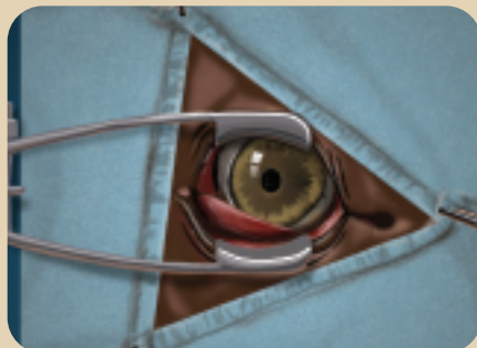
Figure 3: Preparing the surgical area

Drapes are placed in a triangular pattern around the eye and held in place with towel clamps. An eyelid speculum is used to hold the upper and lower eyelids open for surgery.