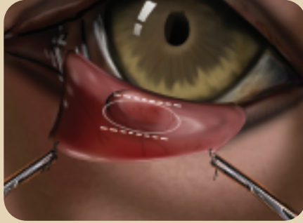
Figure 6: Modified Morgan pocket technique

6A: Preparing a pocket. Make two superficial curvilinear incisions parallel to the free margin on the bulbar side of the third eyelid, one on each side of the prolapsed gland. Make sure, however, not to cut all the way through the eyelid. The incisions should extend the entire width of the third eyelid gland, and the two incisions should not be allowed to intersect each other.