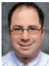
By Ari Zabell, DVM

With timely treatment, practitioners can relieve discomfort and reduce the risk of serious ophthalmic conditions.