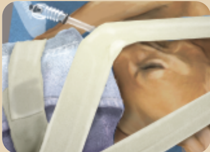
Figure 2: Positioning for the procedure

The patient's head is positioned with towels to elevate the nose and keep the eye parallel to the table. White tape should be placed across the muzzle and at the base of the ear to hold the head in position. The tape should be kept clear of the surgical area.