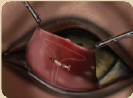
Figure 5: Correcting bent cartilage

Place the third eyelid over the eye so that the palpebral side is exposed, and determine via palpation where the curvature of the cartilage is the greatest. Incise the palpebral conjunctiva to expose the cartilage at the site of the bend, undermine the cartilage to free it from the bulbar conjunctiva and incise the cartilage itself. Preferably, this should be done with Stevens tenotomy scissors to prevent trauma to the surrounding tissues. Then, close your incision and proceed with the third eyelid gland prolapse repair.