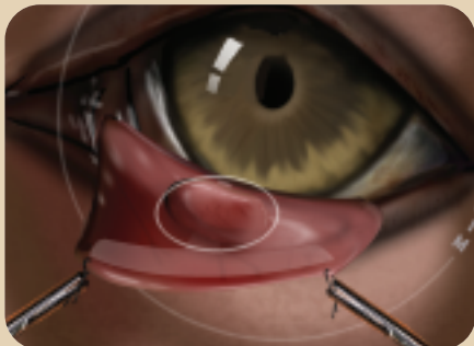
Figure 4: Positioning the third eyelid for surgery

Note that the third eyelid is exteriorized and everted so that its bulbar (interior) surface is exposed. The third eyelid is held in place using the stay sutures at both the lateral and medial edges of the free margin. Note the position of the T-shaped cartilage of the third eyelid (outlined area). The cartilage will not be visualized this easily during the surgery but can be palpated to ascertain whether it has been bent.